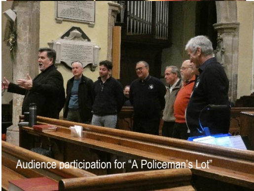
Audience participation for "A Policeman's Lot"